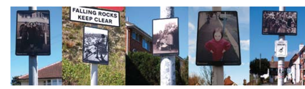
Strange Cargo, Other People's Photographs

Front image: Strange Cargo, Fallen Fruit, Canterbury Festival Opening