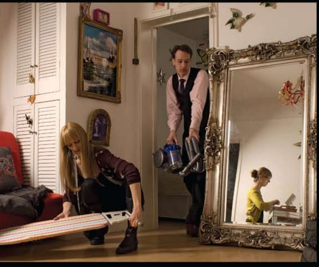
FrenchMottershead, We cope with the pressures of living in a small space, 2011

Thursday 22 September 2011 10.30am - 4.00pm