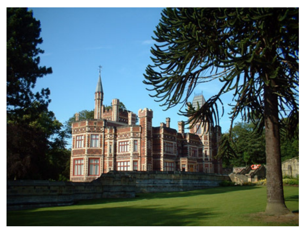
Saltwell Towers from the South Park lawn