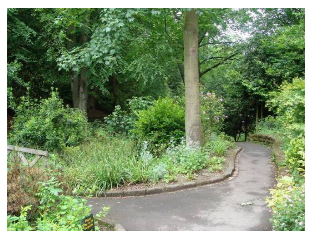
The Saltwell Dene