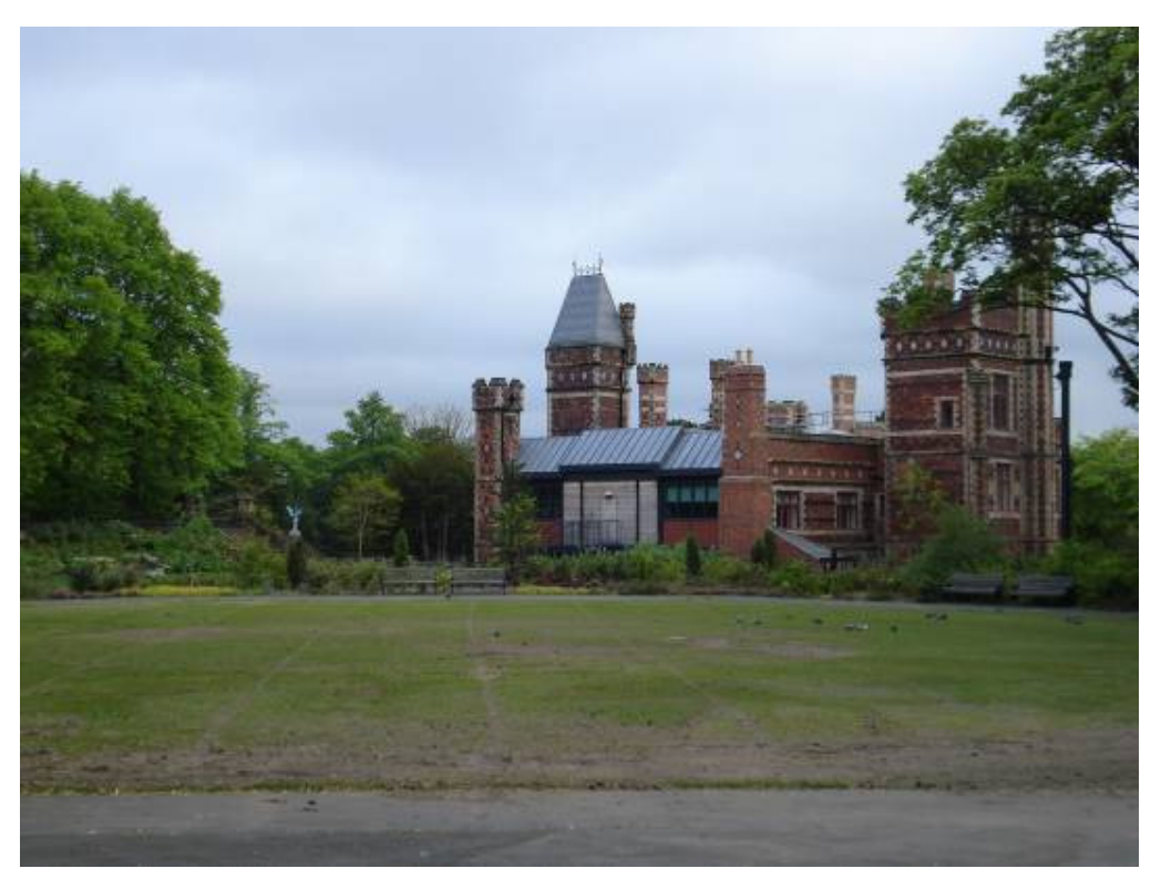
Octagon Lawn and Saltwell Towers