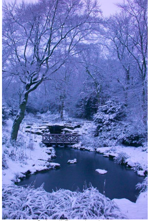
Saltwell Dene in winter