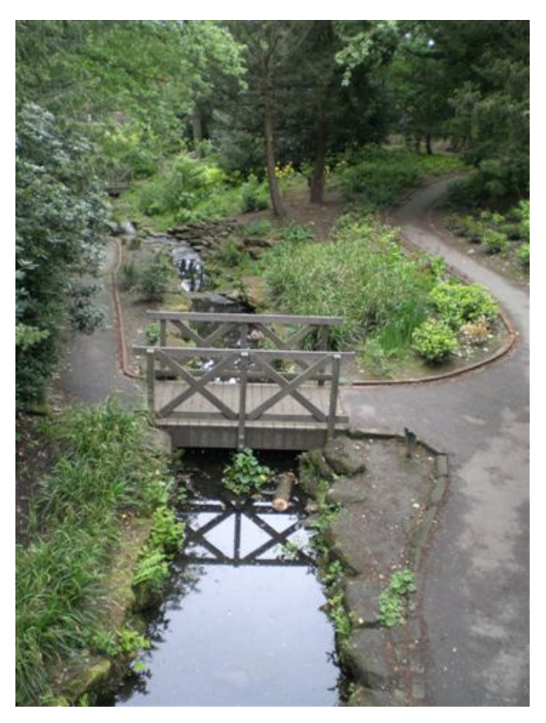
The Saltwell Dene Stream and Walkways