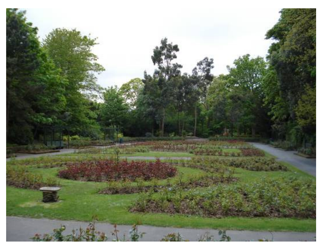
Memorial Rose Garden