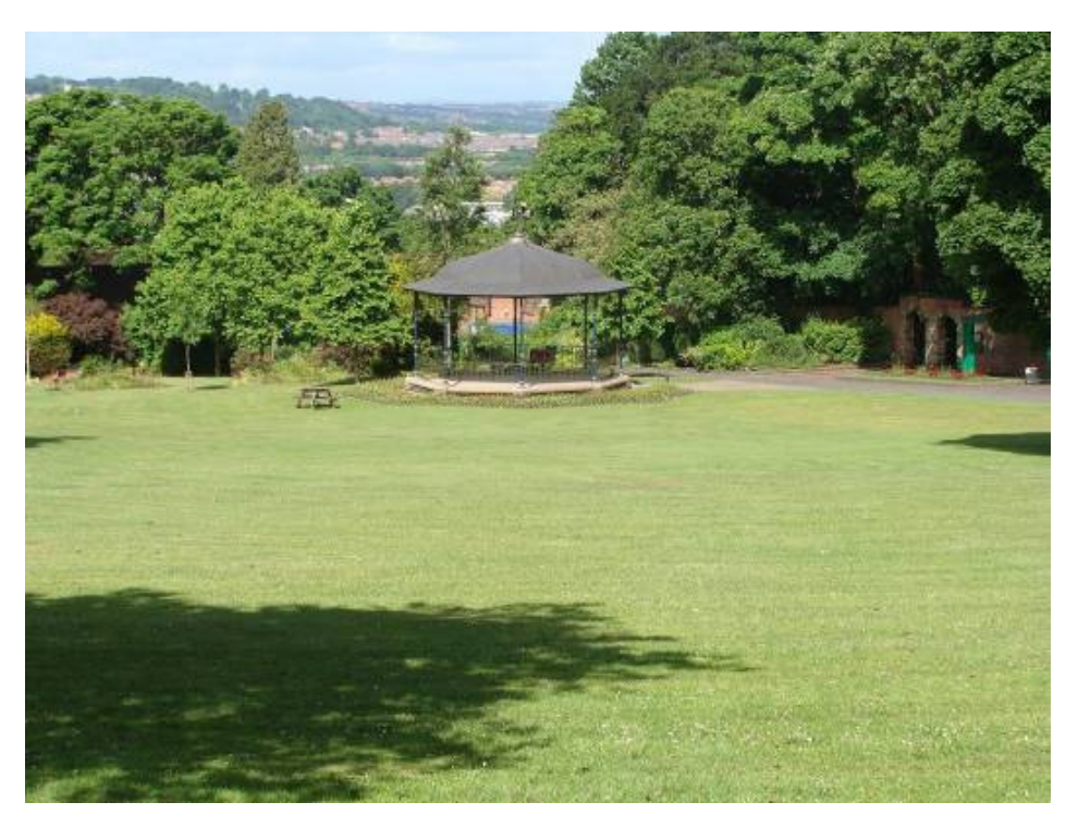
The Grove and Band Stand