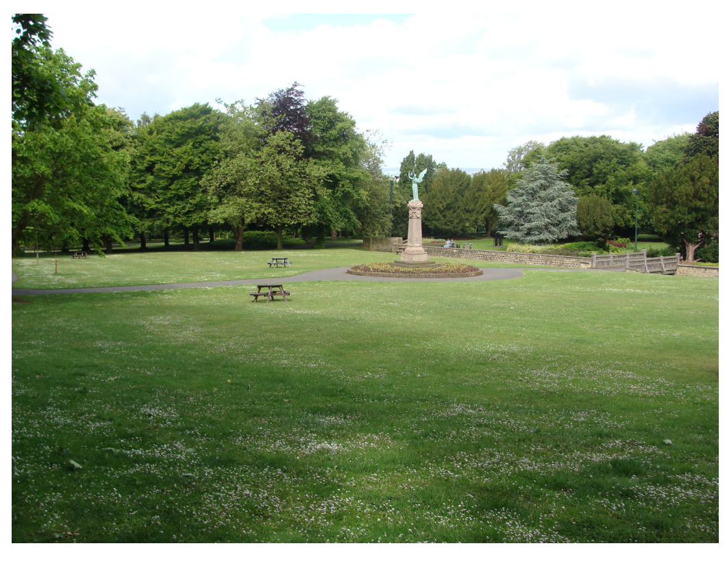
South Park and War Memorial