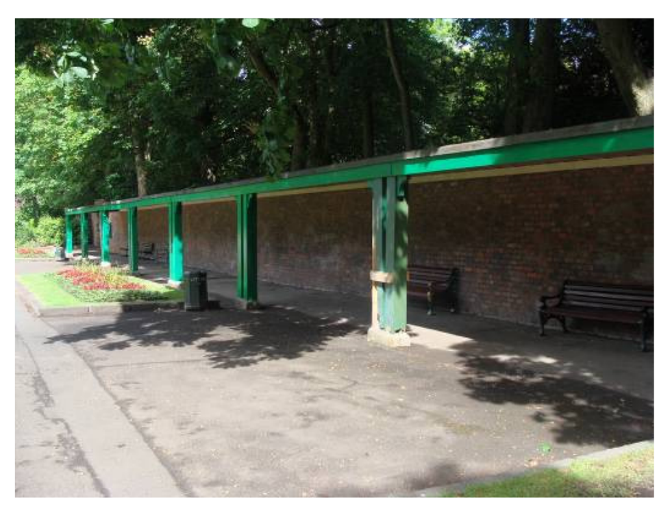
Band Stand Loggia with Seating, The Grove