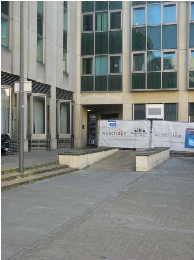
Entrance to alley from Black Lion St: