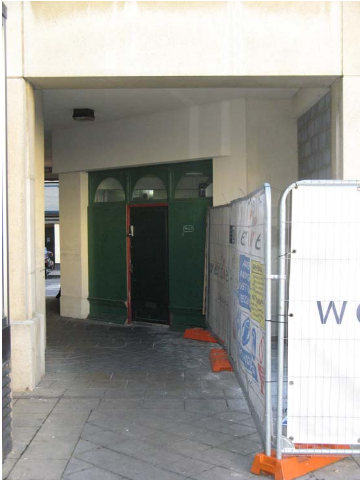
Looking through alley from Black Lion St: