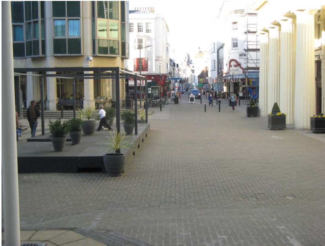
Bartholomew Square from the east side facing west: