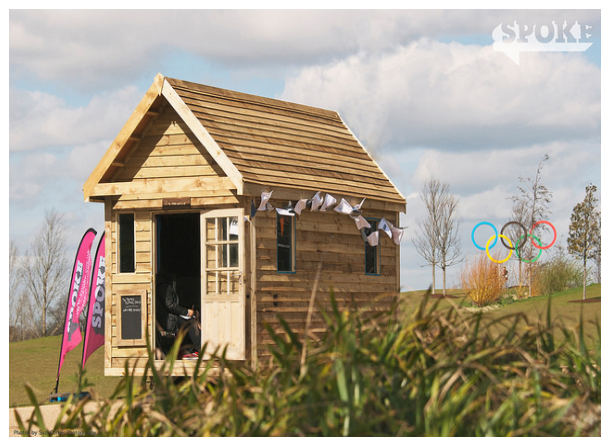
Poetry Potting Shed, A New Direction and Apples & Snakes