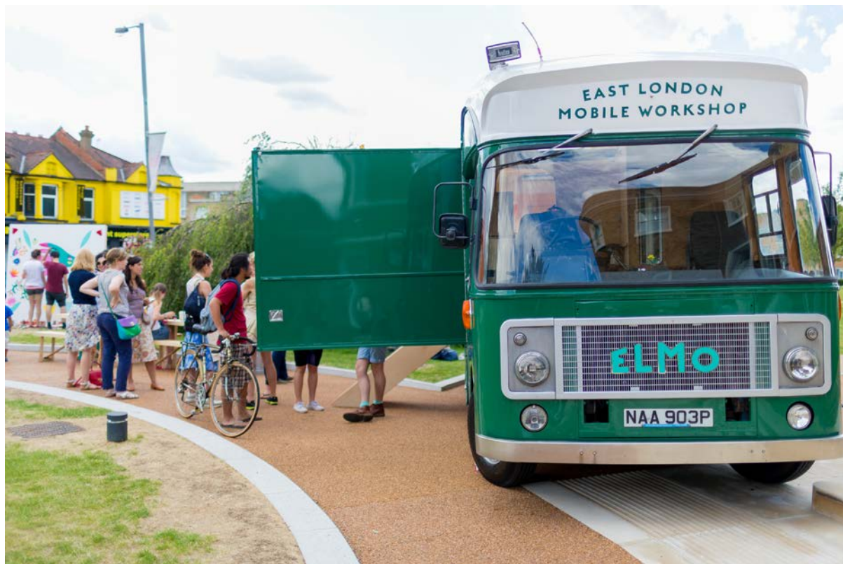
The East London Mobile Workshop commissioned by Queen Elizabeth Olympic Park 2013- 2014

Please read on for more details and how to apply.