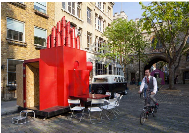
Tiny Travelling Theatre, Aberrant Architecture