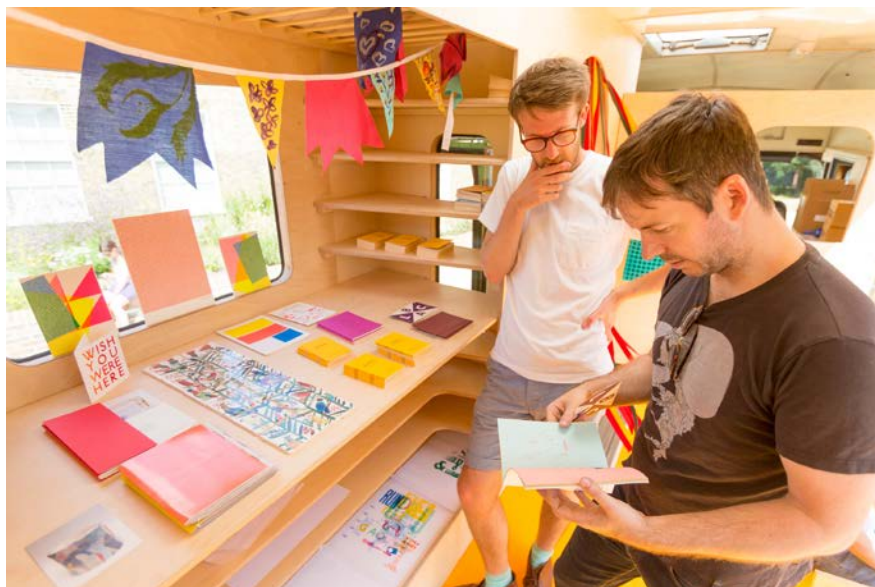
Inside ELMO, designed by Studio Weave and Nous Vous