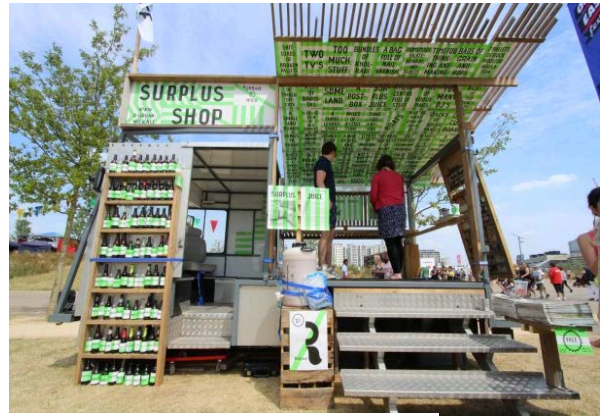
Wick on Wheels, publicworks