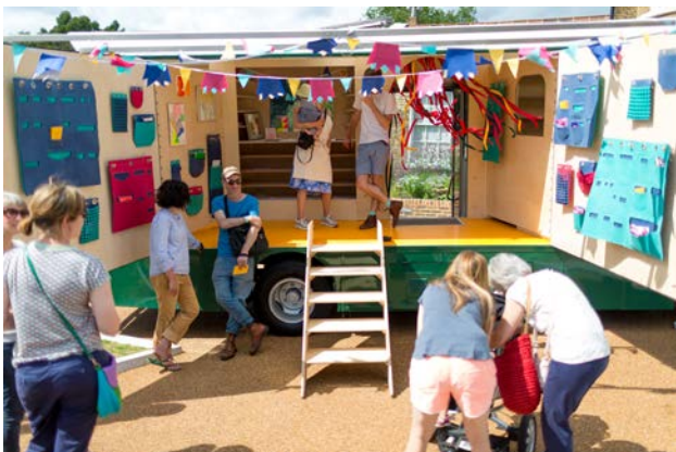
East London Mobile Workshop, Fiona Boundy, Nous Vous