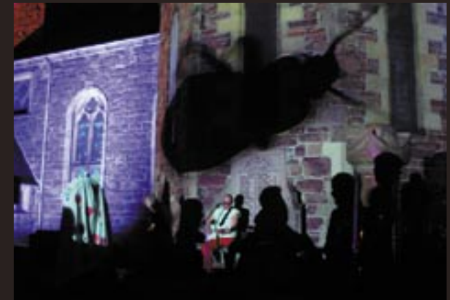
Imagining the Centre 2006 (Cope Reality)

11 th and 12 th September 2009 1pm to 1pm