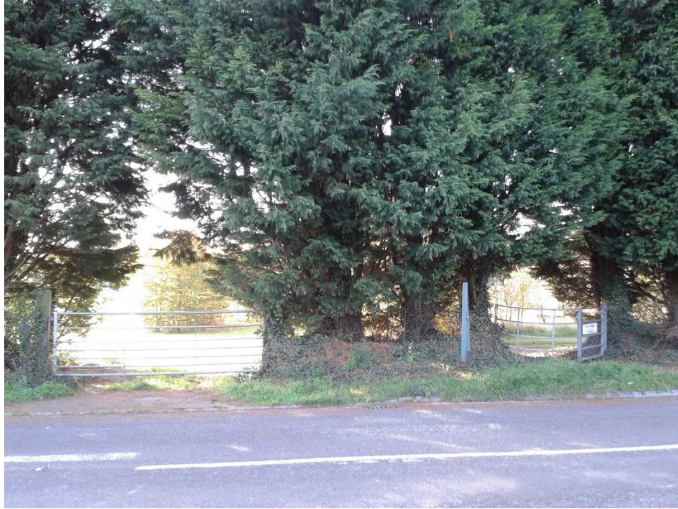
2. The vehicular and pedestrian entrance on Old Oxford Rd