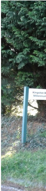
3. Detail of pedestrian entrance