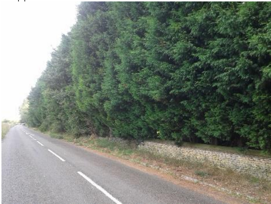
1. Leylandii screening along Old Oxford Road