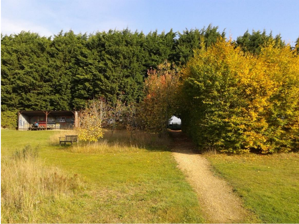
6. Mid distance reverse of pedestrian entrance showing beech car park screening.