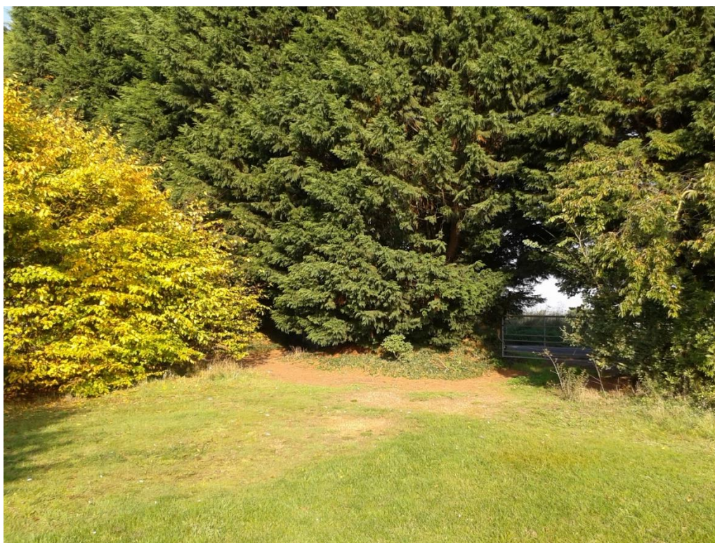
5. Reverse of vehicular entrance – beech hedge screening to left