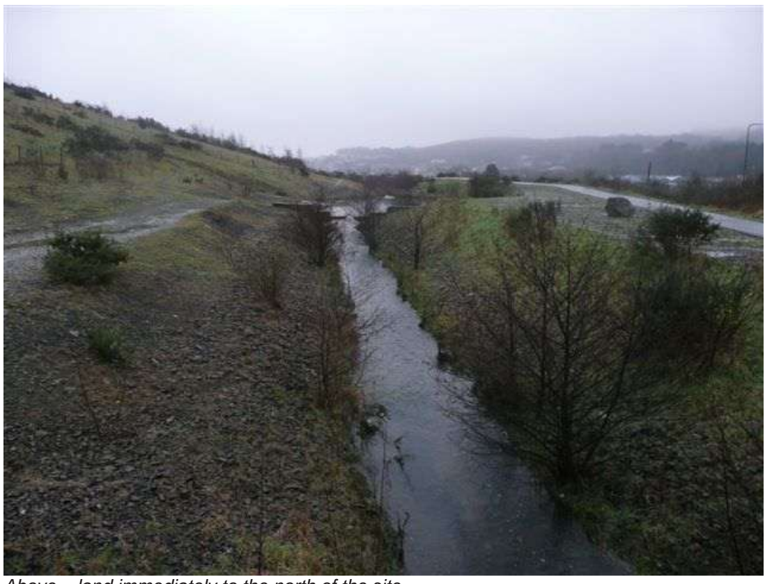
Above – land immediately to the north of the site.