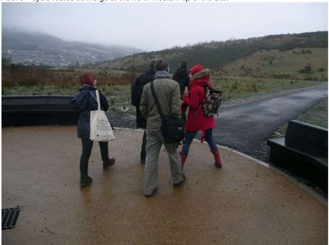
Above – the seating area looking towards the site.

Above – cycle routes converge at the north-western tip of the site.