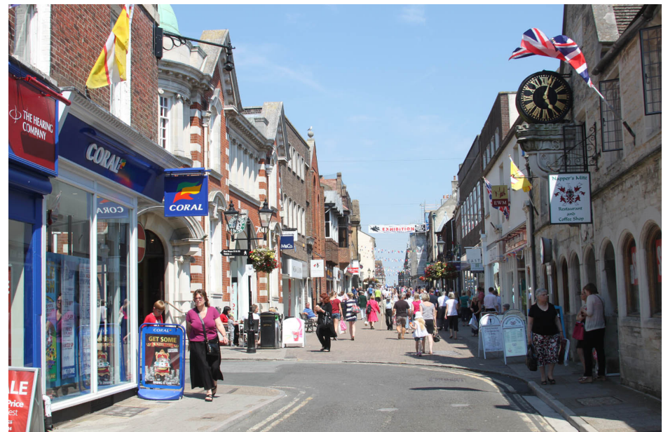
Photos of central Dorchester