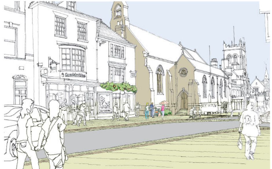
Artist's impression showing High West Street, Dorchester

Dorset County Council's Cabinet will be invited to approve the revised, phased approach to DTEP on 5th September 2012.