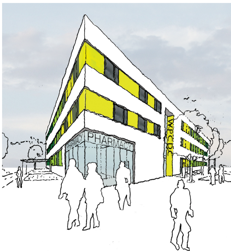
The Adelaide Health Care Centre design

This new building has created the opportunity for members of the community to gather and receive all the necessary services in one place where previously, service provision was scattered across the city. The building features a stunning atrium which is the central reception and meeting point of the building. A café will be contained within the atrium and will provide healthy snacks and lunch items as well as hot and cold drinks.