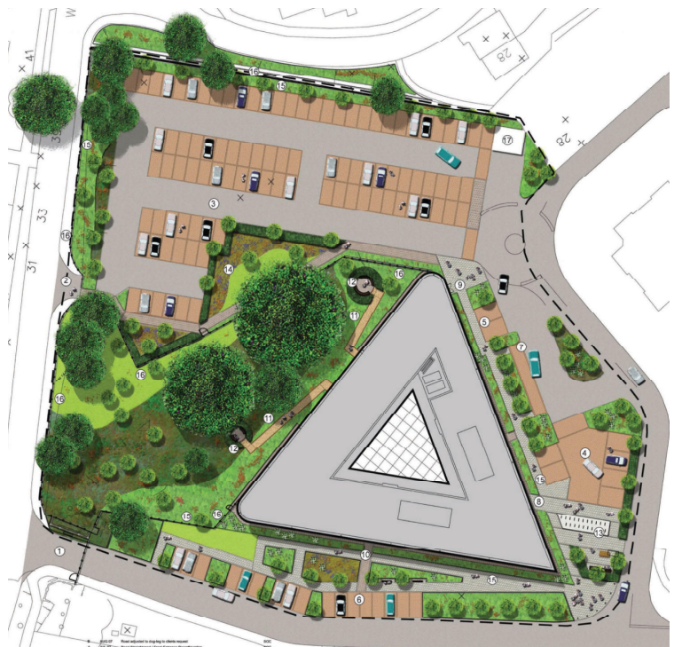
Aerial view of Adelaide Health Care Centre

Danielle Evans South West Hampshire LIFT 2 nd Floor, Oakhill House 2-6 Romsey Road Shirley, Southampton SO16 4BZ