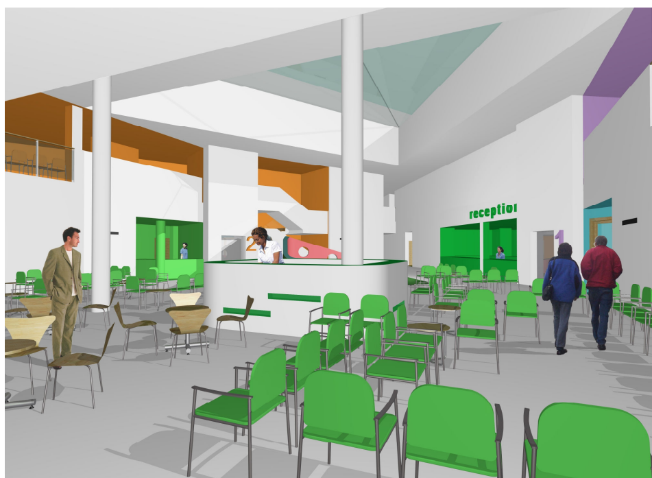
Design layout for the reception area