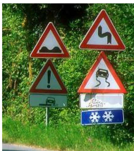
l. Streetscape Abbotsbury