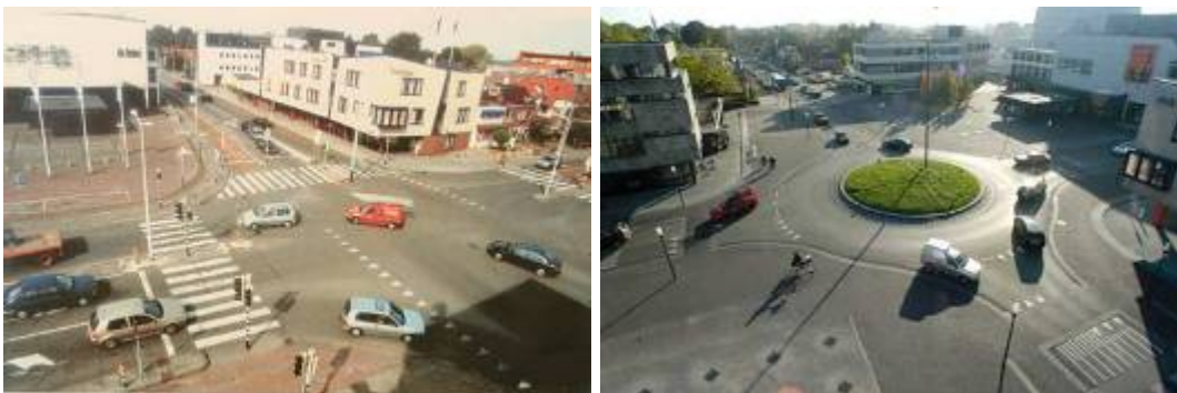
The concept of “naked streets” by Dutch Engineer Hans Monderman, photos before (l) and after (r).

In achieving this there is also the opportunity to utilising the principals of psychological road calming in order to encourage traffic to drive more safely. This approach aims to reduce drivers speed at appropriate points without large quantities of signage through increasing perceptual risk for drivers. This has been achieved in pervious road schemes by narrowing roads, marking entrances to built up areas and creating shared spaces between cars, pedestrians and cyclists.