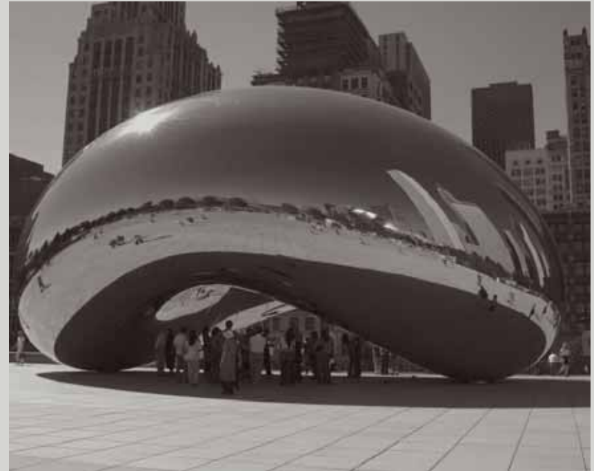
Cloud Gate, Chicago 2004

Kapoor's work is collected worldwide, notably by the Museum of Modern Art in New York, the Tate Modern in London, Fondazione Prada in Milan, the Guggenheim in Bilbao, the De Pont Foundation in the Netherlands and the 21st Century Museum of Contemporary Art in Kanazawa, Japan. Kapoor has also been chosen to design the British Memorial sculpture at Ground Zero in New York.