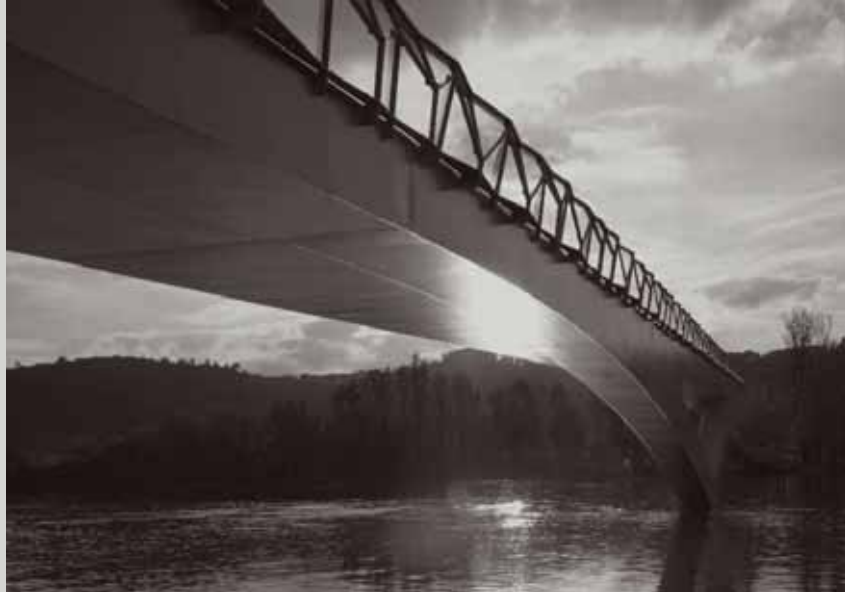
Coimbra Bridge, 2006. Balmond/AGU