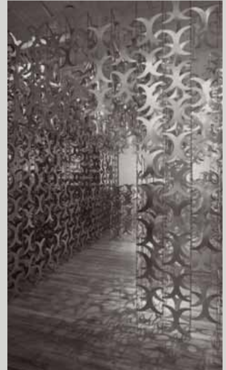
Hedge, Artists Space, New York 2006. Balmond/AGU