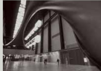
Marsyas, Tate Modern 2002. Artist: Anish Kapoor