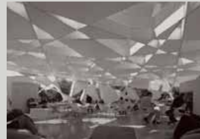
Serpentine Pavillion with Toyo Ito, London 2002