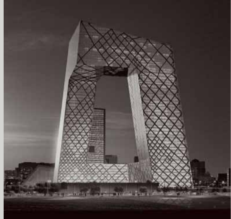
CCTV, Beijing 2009. Architect: OMA

Cecil Balmond is the author of 'No. 9' (1998), and 'Informal' (2002) which has won The Banister Fletcher Prize for best book on architecture. Last year saw Prestel's publication of Balmond's latest book 'Element' and a major exhibition of his work at The Louisiana Museum of Modern Art in Denmark. Balmond's art piece 'H-Edge' originally created for a solo-show for Artists Space New York (2006) will be the focus of an exhibition later this year at The Graham Foundation in Chicago.