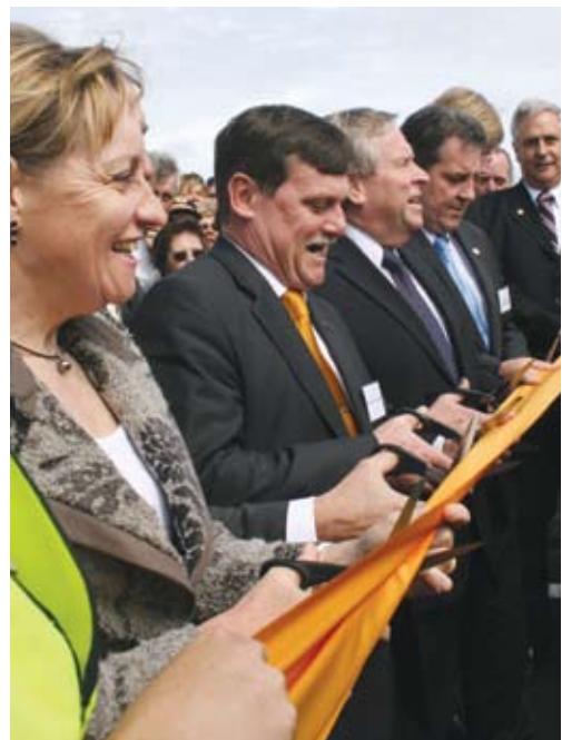
Continued on page 2

In his opening speech the Premier said the construction of the Kwinana Freeway extension and Forrest Highway would provide a world-class transport corridor and bring immeasurable long term economic benefits for the South West.