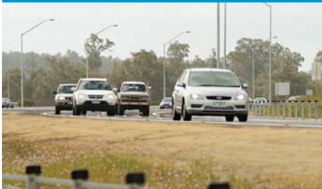
The first cars on the Kwinana Freeway extension

The Alliance thanks residents and road users for their patience and cooperation over the last three years and is proud to have made the journey to the South West safer, quicker and more affordable.