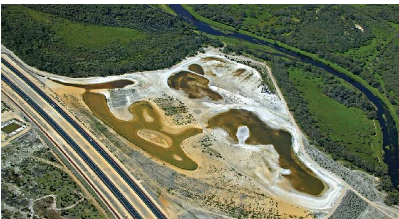
The Anstey Wetlands in Karnup