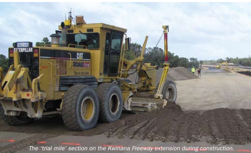
The 'trial mile' section on the Kwinana Freeway extension during construction.

As part of a Main Roads WA initiative, the Kwinana Freeway extension features a section of road made up of 15 pavement research trials that will be monitored over the next 20 years.