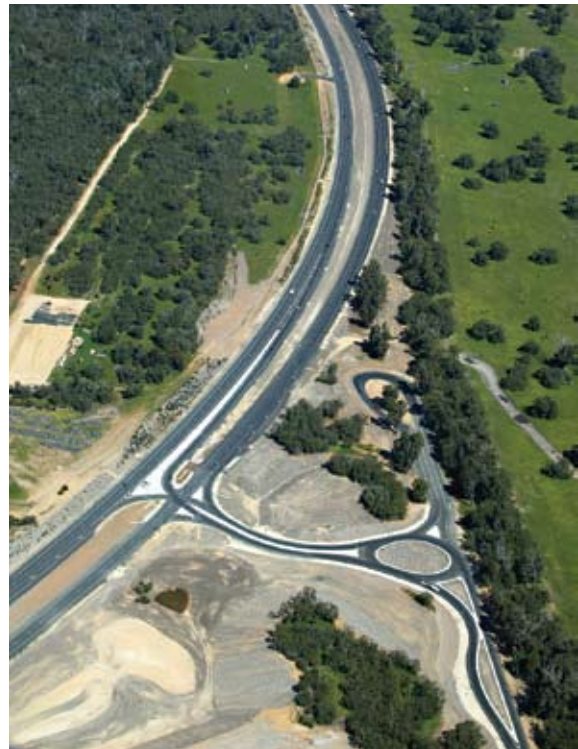
The Forrest Highway tie in with Old Coast Road in Lake Clifton