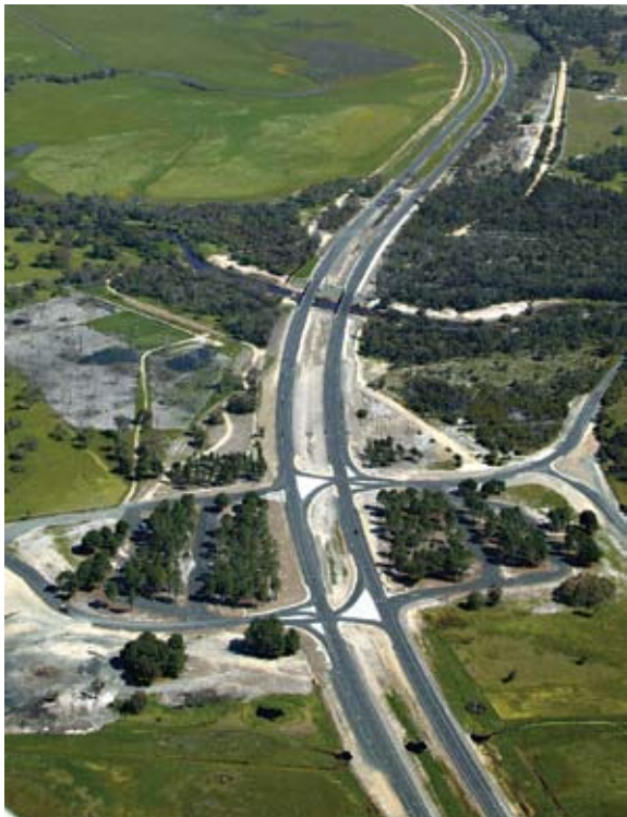
The Dorsett Road intersection and Harvey River bridge