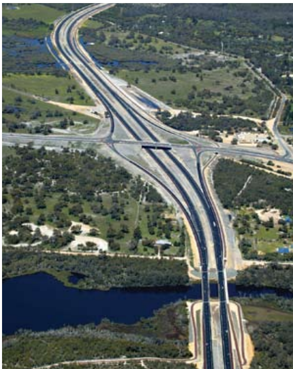
The Serpentine River bridge and Lakes Road interchange