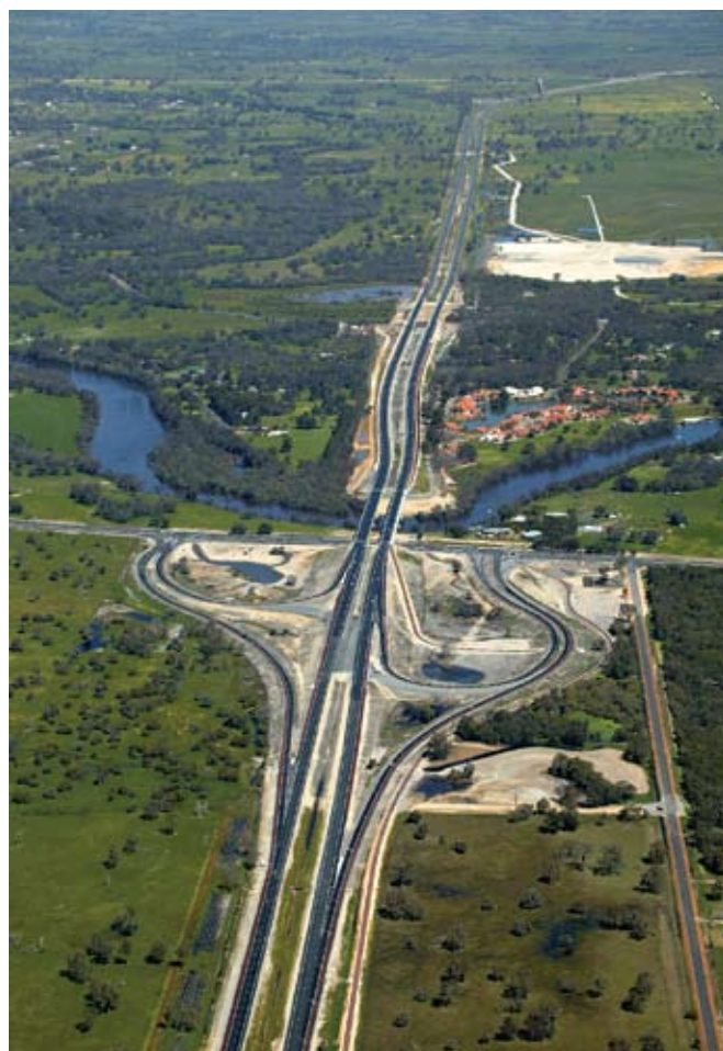
The Pinjarra Road interchange and Murray River bridge