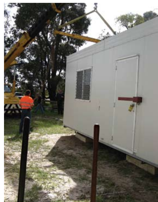
Lowering the site offices into place