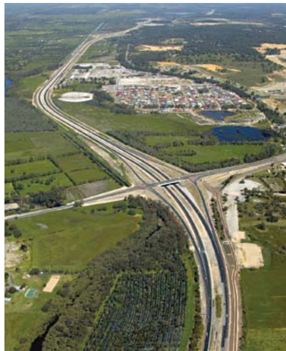
The Safety Bay Road interchange and start of the Kwinana Freeway extension