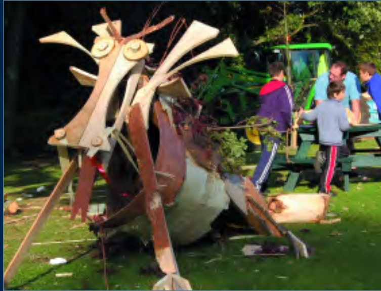
Annual Family Sculpture Day held in Saltwell Park, Gateshead