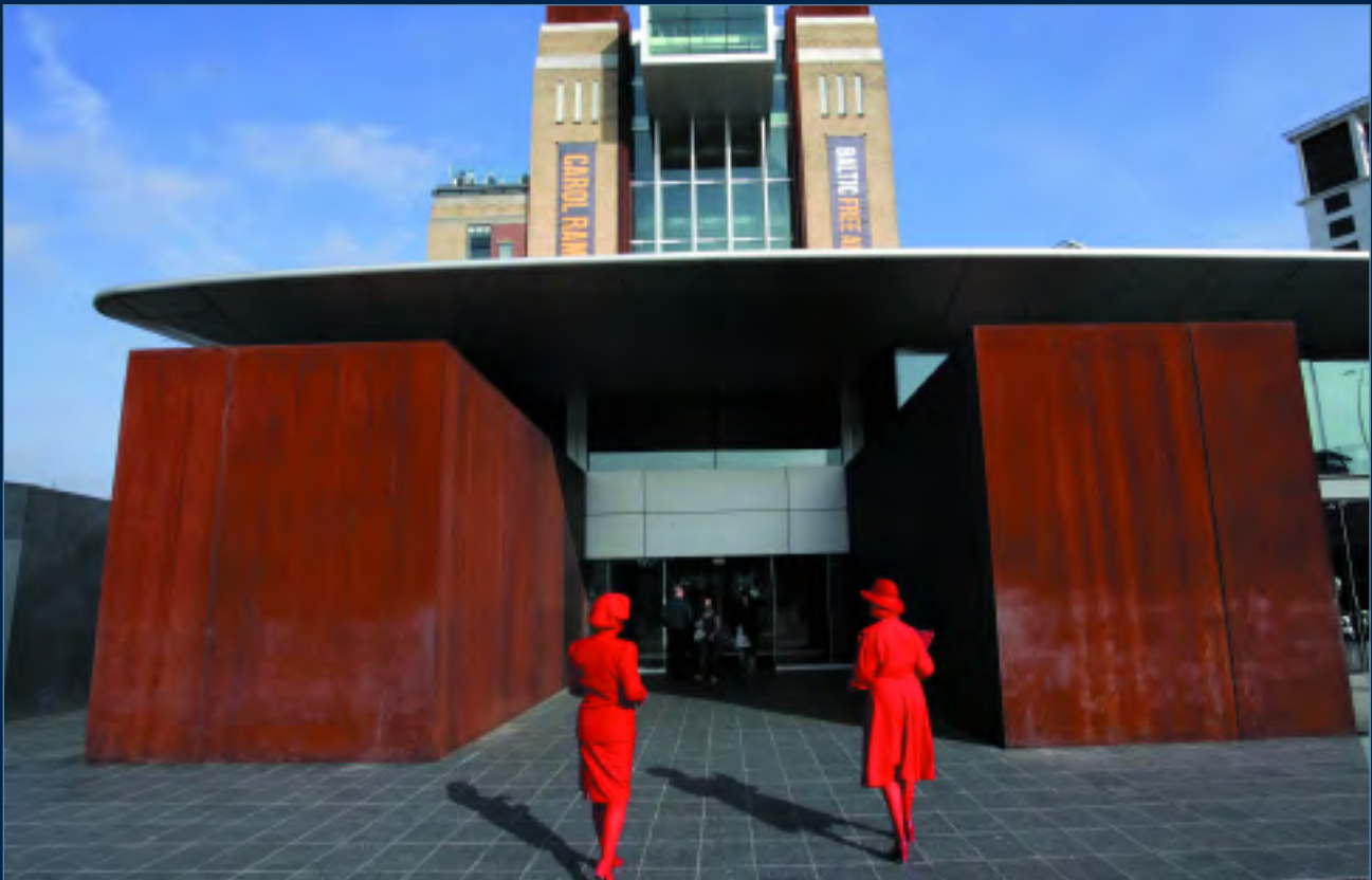
Natural Theatre Company

from sequential firework displays from the top of the car park, thematic billboards involving community groups, text based artwork and street theatre.