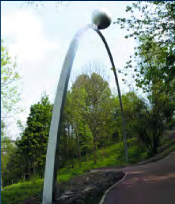
Rolling Moon by Colin Rose

This elegant curved steel sculpture represents the moon's effect on the oceans' tides in relation to maritime history. The sculpture spans 27 metres and reaches a height of 11 metres at its peak. Visible at a distance from across the river, the sculpture nestles discreetly into the bankside and has become one of the most well known public artworks in Gateshead.