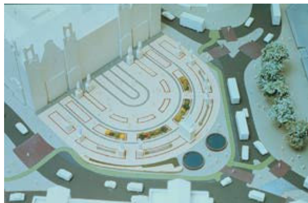
Scheme for re-siting existing City Square statues

At the east end of The Headrow, one of the city centre's central roads, a disused petrol station has been converted into a fountain to be operable at the beginning of the new Millennium year, a project supported by both the city council and the Scurrah Wainwright Charity, a trust which is involved in other public art proposals for Leeds, significantly involving new sculpture. x A new hotel, restaurant and retail centre, The Light, currently being constructed just off the Headrow will also involve public art, following the recent completion of Number One City Square which features commissioned sculpture as part of its front façade.