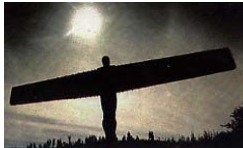
Angel of the North, Antony Gormley

politicians and the local press, inhibited further public art development within Leeds for a number of years.