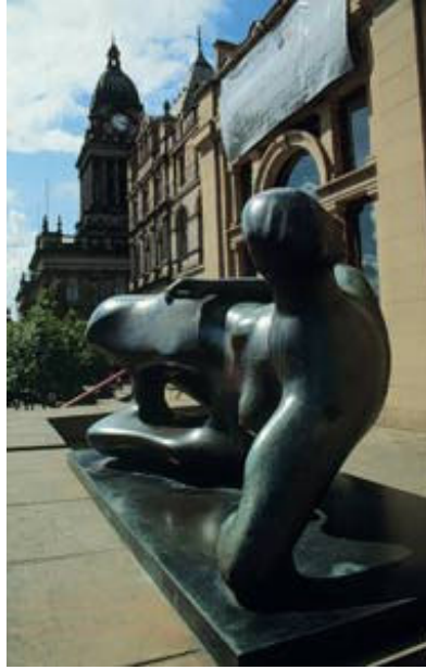
Reclining Figure, by Henry Moore

And while there were a few other examples, including the occasional contemporary mural, nonetheless in 1996 Smales and Whitney commented that in Leeds there was ‘a marked absence of meaningful and relevant public art and sculpture’ and that ‘Leeds had no clearly articulated policy towards the use and development of public art within the city.’ (Smales and Whitney :1966).