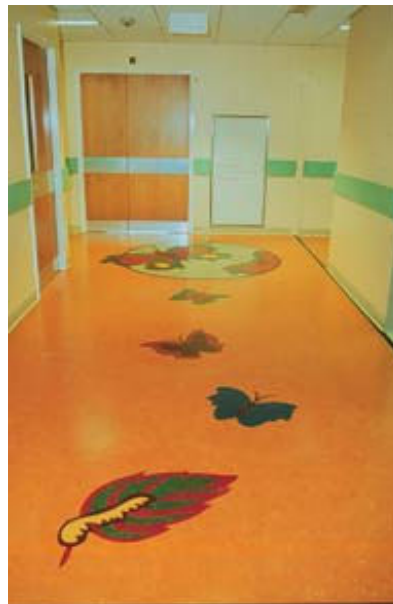
Floor, Leeds General Hospital