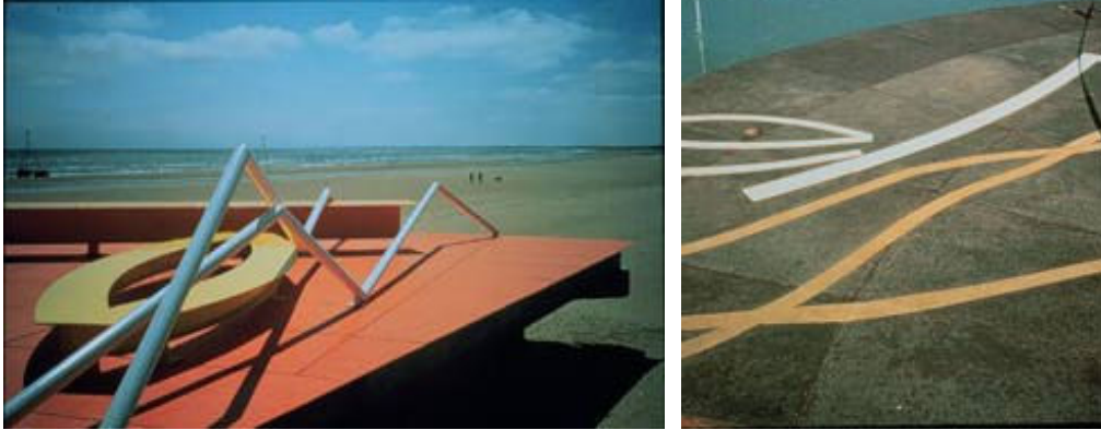
Views of Bridlington Seafront, Bauman Lyons/Bruce Maclean

The final product is an illustration of how the visual creativity of the artist can be embodied in an architectural project, with architect and artist working closely together to realise aesthetic, design and social solutions.