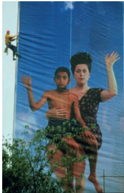
Banner at entrance to hospital car park

Within the programme artists and craft designers have been commissioned to work closely with the architects in applying their work to the hospital environment to make it more interesting, creative and user friendly. Such projects have included the creation of a relaxing roof garden and a large banner to welcome visitors to the hospital car park.