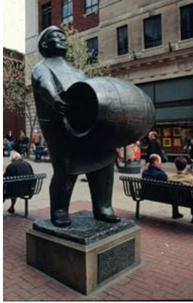
Dortmund Drayman, 1980