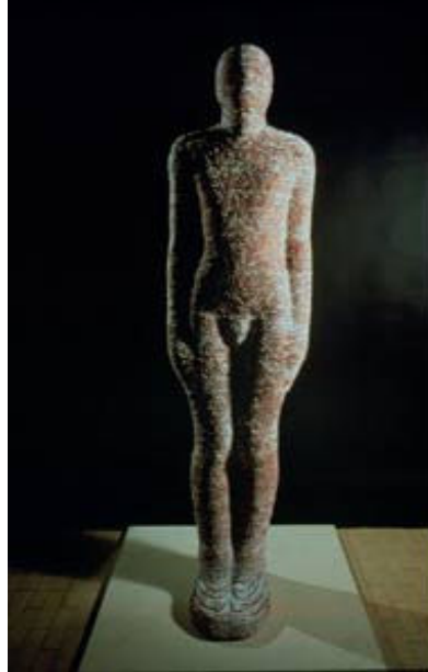
Brickman Maquette, Antony Gormley

Situated in the southern industrial part of Leeds just outside the Leeds main railway station, the site is surrounded by railway lines. The proposal that emerged was for a 35 metre statue, entitled Brickman by the artist Antony Gormley, not so well known then as he is today with works such as his Angel of The North .