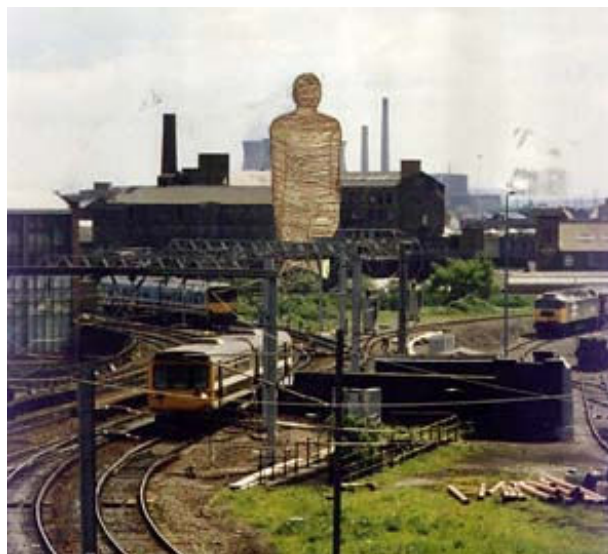
Brickman Proposal, Antony Gormley

The Brickman proposal engendered much controversy and debate, not only in Leeds but also in the national press of the time. After a sometimes bitter struggle with local politicians and media, the project failed in 1988 to achieve planning permission from the Leeds City Council and the project was eventually abandoned. Not only was an opportunity lost for Leeds to have been internationally innovative with a high profile contemporary public art development, but the Brickman might have gained for Leeds the kind of publicity and influence on regeneration that the Angel of The North appears to have achieved for the North East of England a decade later. v However, the Brickman debacle, given the bitter hostility shown to the proposal by key local